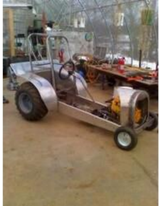
2011 12" OPEN CLASS