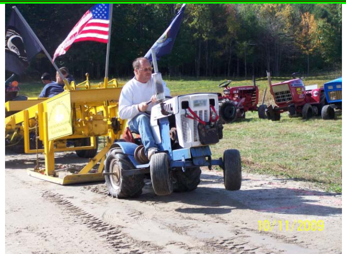
1978 SEARS SS15